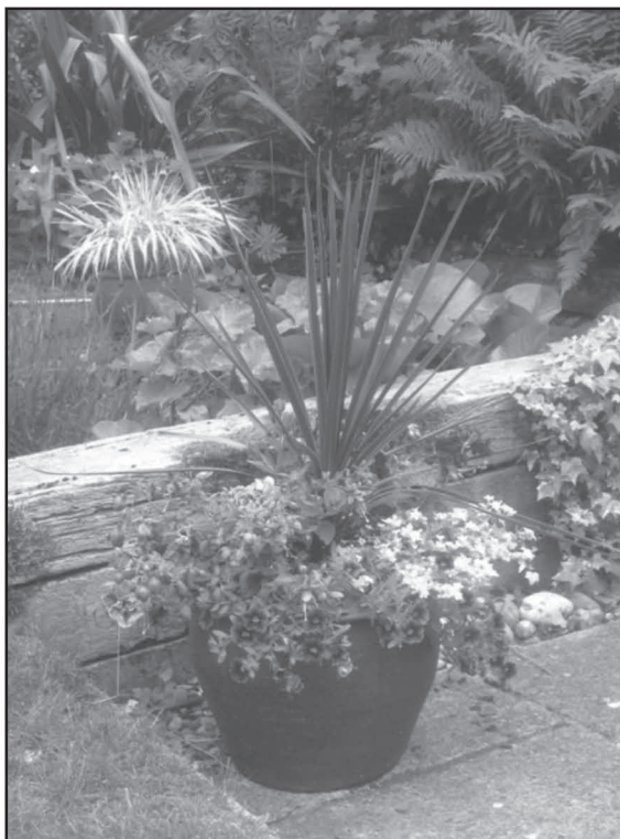
Plant up pots with colourful summer bedding