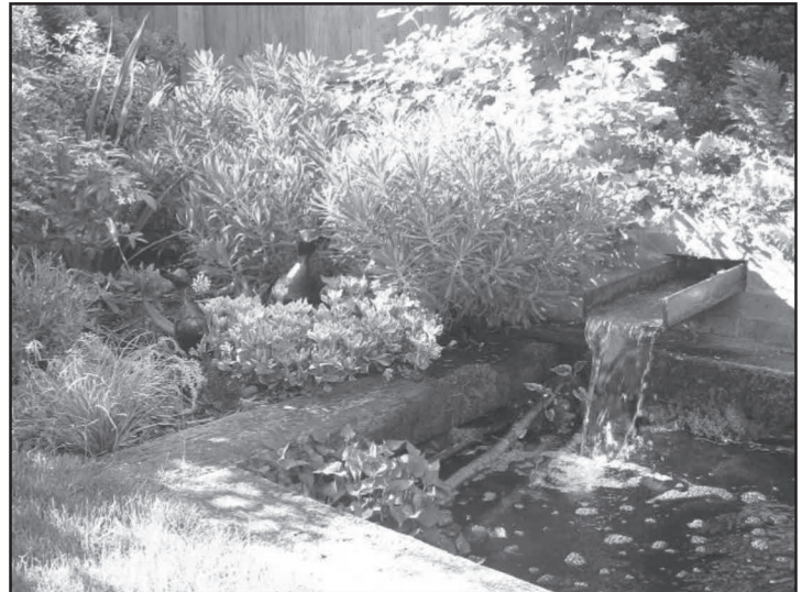
Refuge from the worried world around us.

As soon as the leaves are beginning to appear on roses then spray with Roseclear. It can be used fortnightly up to 4 times and this will see them through the year, preventing the usual pests and diseases they normally get. Tackle the problem before it occurs.