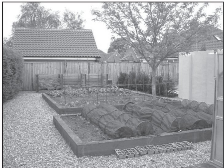
The veg plot