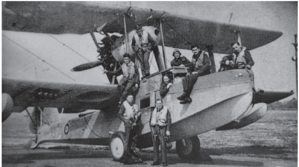
Supermarine Walrus (X9521), at Martlesham. Fitted with both wheels and floats it could alight on the sea and with a retractable undercarriage could return them to Martlesham

Volunteer Reserve was flying Martlesham Walrus HD926 and was involved in a particularly dramatic rescue on the 16th September 1944. A Halifax of 420 Squadron, Royal Canadian Air Force, had been part of Bomber Command's attack on Kiel on the night of 15th September. The crew had just taken delivery of a new Halifax and had promised the ground crew that they would try and look after it! However, they were hit by flak over the target and started to lose fuel and hydraulic fluid. They were about half way across the North Sea before they were forced to ditch. They had lost Verey pistols and flares but were all safe although violently seasick!