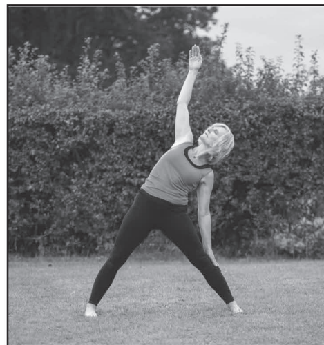
Trikonasana, the Triangle

Triangle (Trikonasana) or to a easy, seated forward stretch. And always begin with Tadasana, the Mountain (standing) pose. I often say to my clients that when practised well, with precision and serenity, this pose is all you need. So just find a quiet spot, stand in Tadasana, relax your shoulders, align your feet, watch your breathing become lighter