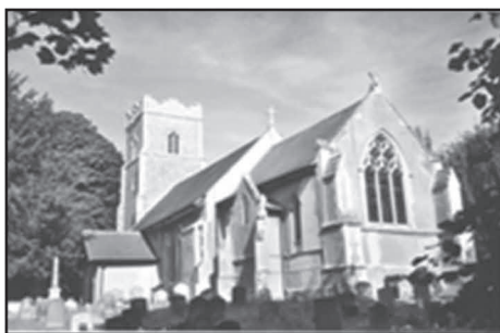
St Mary's Martlesham

With grateful thanks from the Church Wardens of St. Mary's.